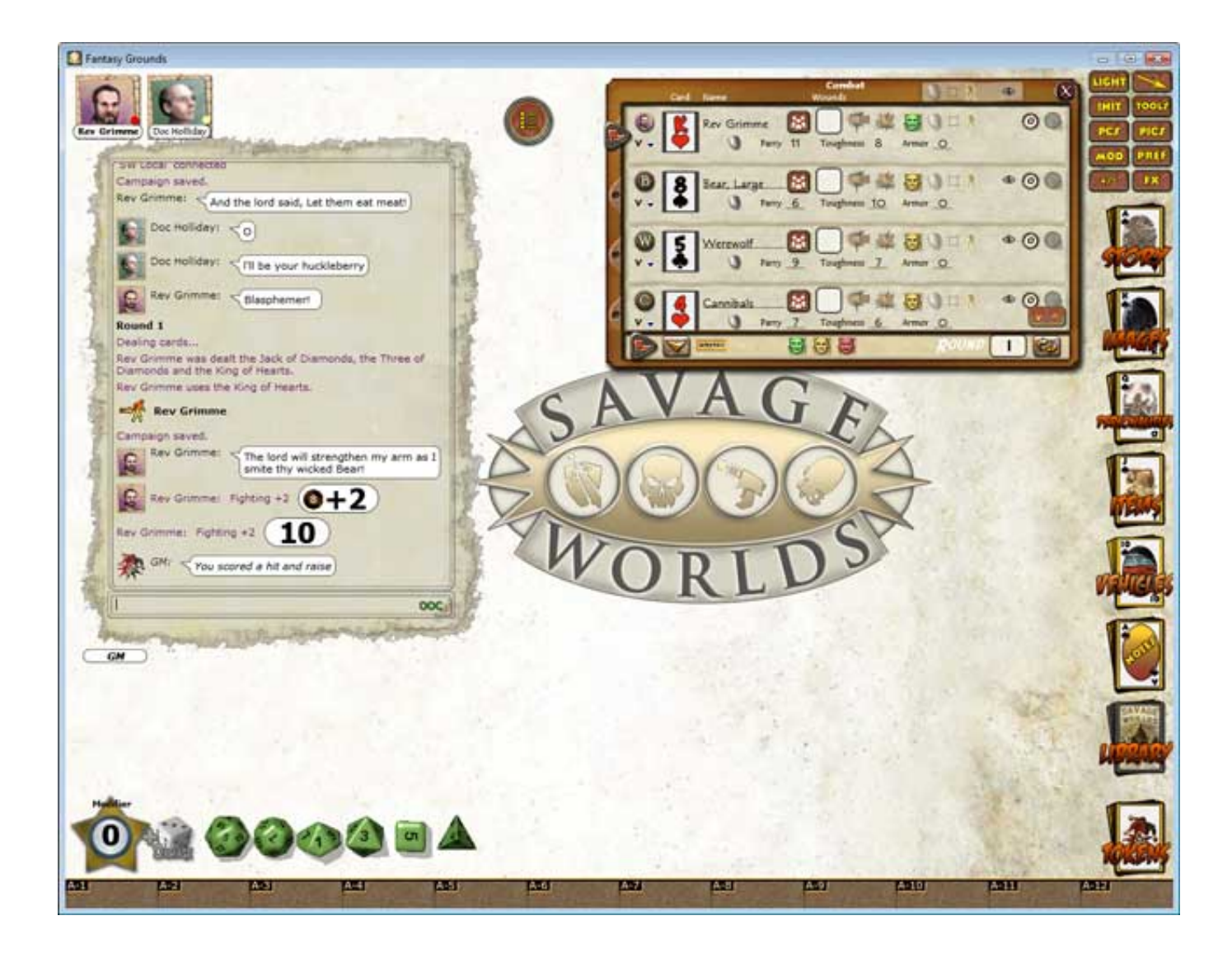
Fantasy Grounds - Savage Worlds Ruleset Crack By Razor1911 Download

Download ->>> <a href="http://bit.ly/2JnspxL">http://bit.ly/2JnspxL</a>