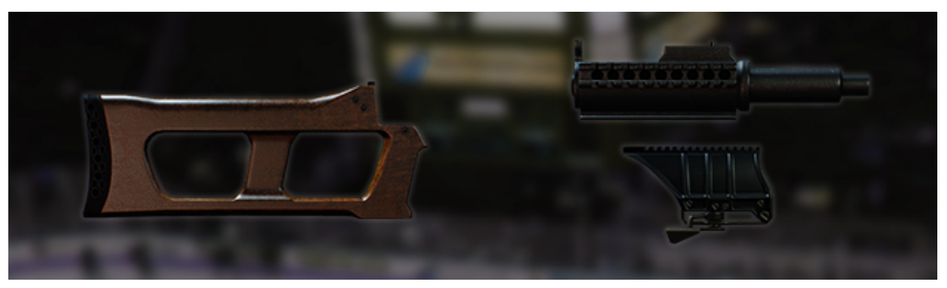
•Three new weapon mods – Three new weapon modifications have been added so you can shape the Valkyrie rifle into the type of weapon you want.