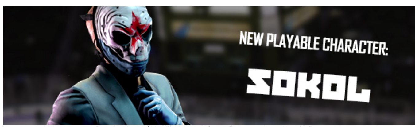
Though young, Sokol has everything to become a legendary heister.

The Sokol Character Pack is the 25th DLC for PAYDAY 2. It allows heisters to play as Sokol the Russian, the Grinder of the PAYDAY gang. Other than Sokol himself, it includes the Grinder perk deck, Sokol's mask, Sokol's hockey stick melee weapon and the Valkyrie rifle.