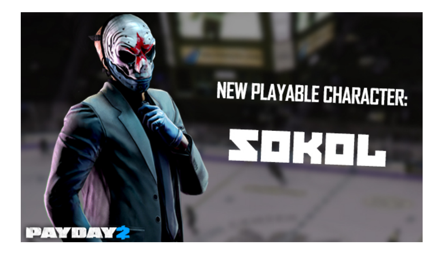
PAYDAY 2: Sokol Character Pack Ativador Download

Download ->->-> <a href="http://bit.ly/2NFRcl3">http://bit.ly/2NFRcl3</a>