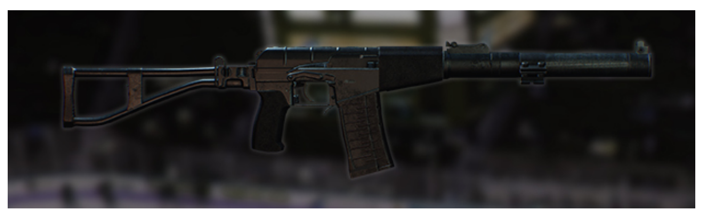
•New rifle – The mythological Valkyrie would bring those slain in battle to Valhalla. This Soviet-era Valkyrie most likely did the slaying.

•Grinder perk deck – The grinder deck is inspired by ice hockey, where it reflects a strong work ethic, team play and a willingness to reduce an opponent into bloody fragments.